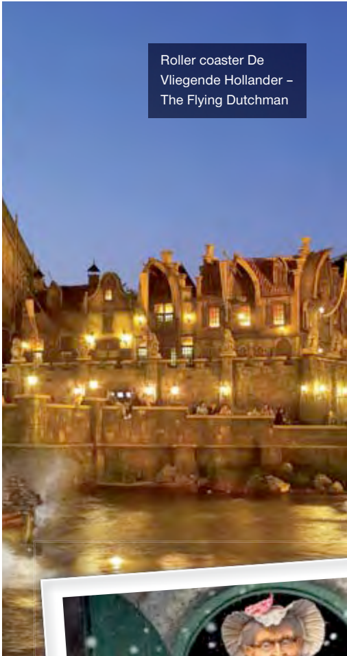
Roller coaster De Vliegende Hollander – The Flying Dutchman