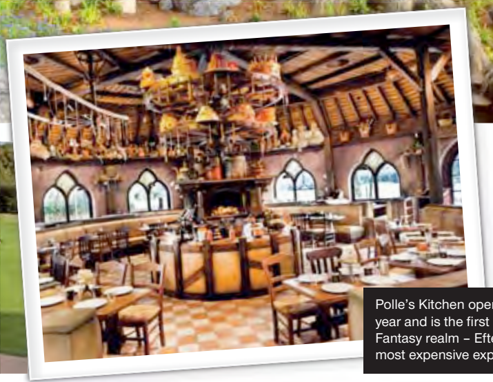
Polle's Kitchen opened this year and is the first part of Fantasy realm – Efteling's most expensive expansion